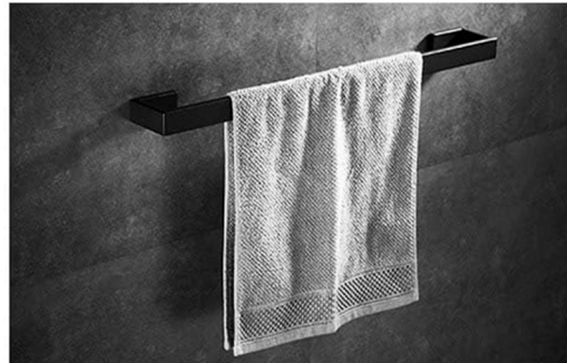
Step 6: Hang that towel!