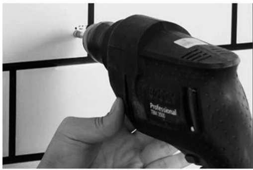
Step 2: Drill with a 6mm bit holes