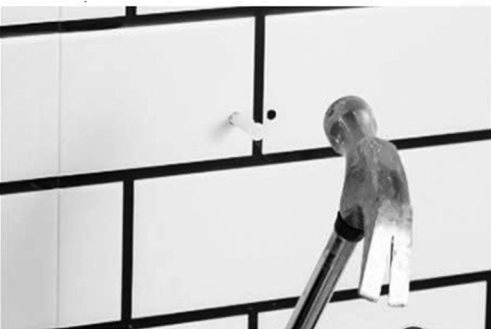
Step 3: gently hammer in anchors .