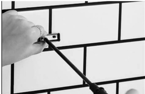
Step 4 screw in brackets to wall where anchors are.