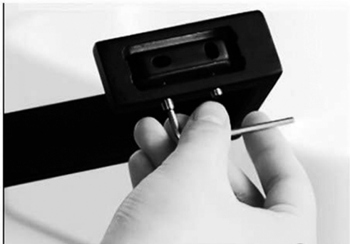
Step 1: unscrew the brackets on the back.