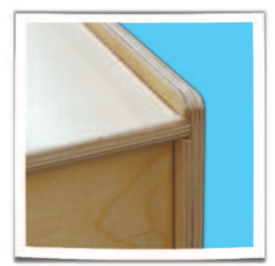
Typical Recessed Plywood Backs