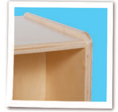
Typical Corners & Edges