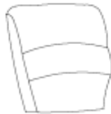
A 1* Left Backrest