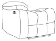
A 1* Left Chair Seat