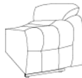
C 1* Right Chair Seat