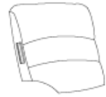
D 1* Right Backrest