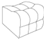
B 1* Chair Seat