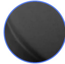
Satin Black - 190