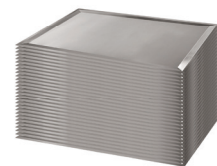
Pack of 28