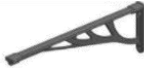
②: Bracket (x3)