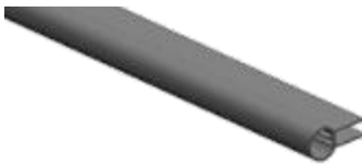
⑤: Frontal Fixing Bar (x2)