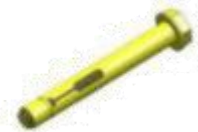
⑥: Setscrew (x6)