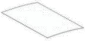
①: Board (x2)