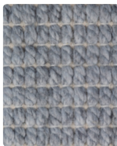
GREY - Grey