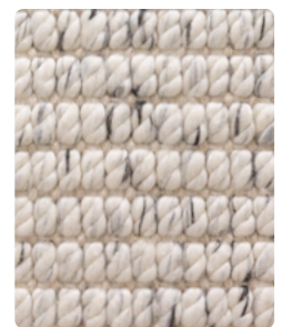
NATU - Natural