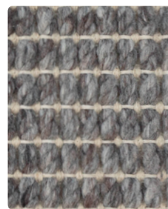
DAAS - Dark Ash