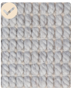
LIBR - Light Brown