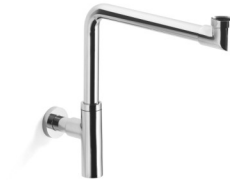
WSBC 53921 Space saving