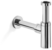
WSBC 53922 Our best seller