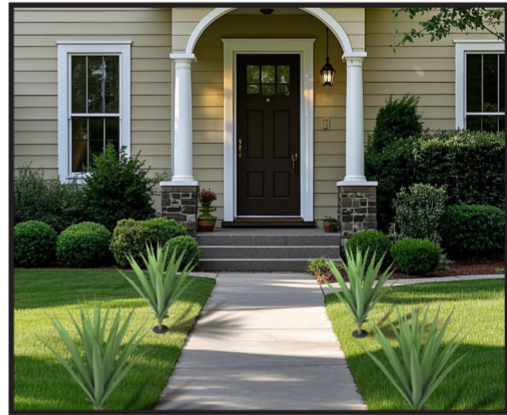
Step 4: Easily installed in soil or decorative planters.