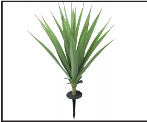
Step 3: Adjust the blade angle to make the leaf shape stretch and natural. (Warning: simulation design edge with barbs, need to pay attention to safety)