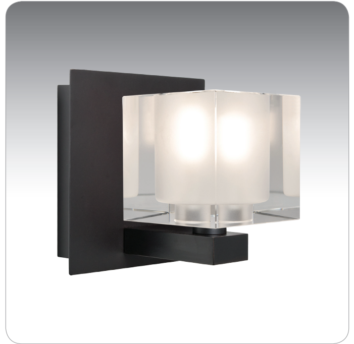
CLEAR/FROST IN BRONZE

UL or ETL Listed. Suitable for Damp Locations (interior use only).