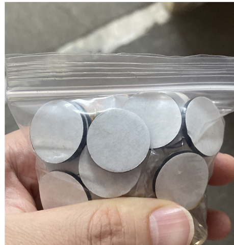
Image 4: Gaskets, used for fixing the metal frame and the tabletop