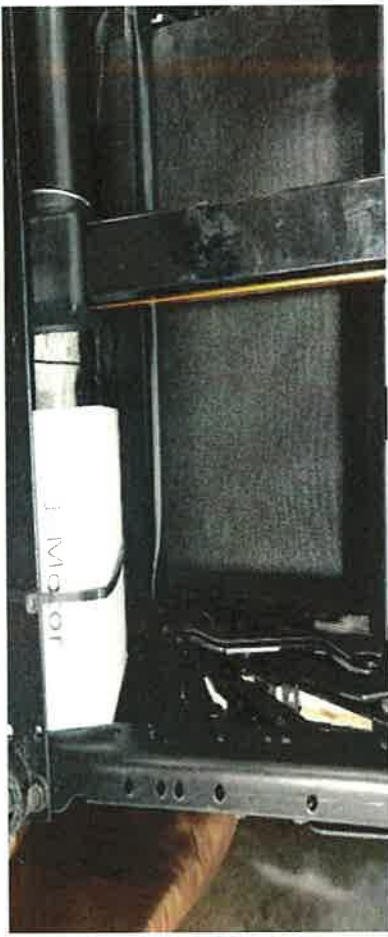
Power pack placement under the recliner. This box contains the power pack along with instructions on how to assemble. There is a diagram included in the box.