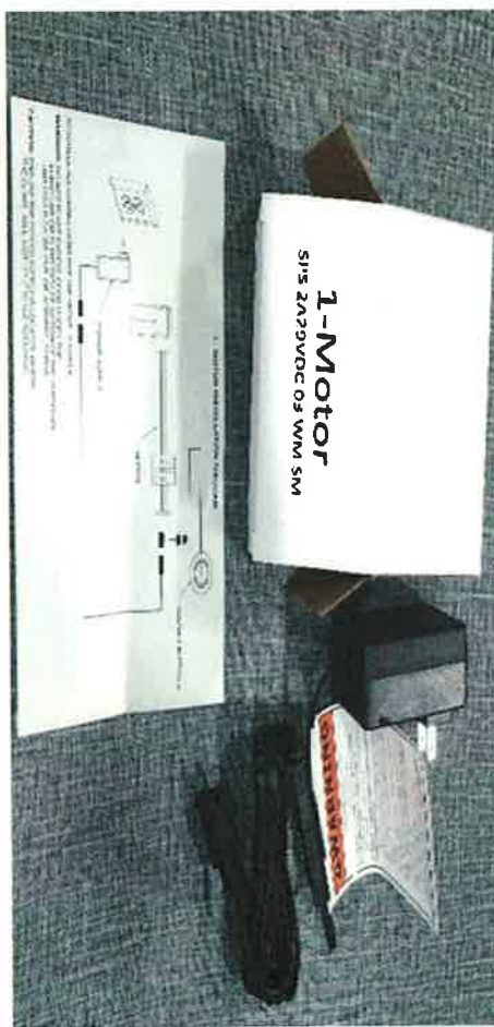
Motor Box contents. Power pack, cord and diagram instructions.