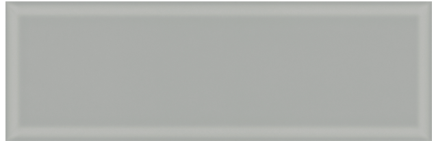
LIGHT COOL GRAY