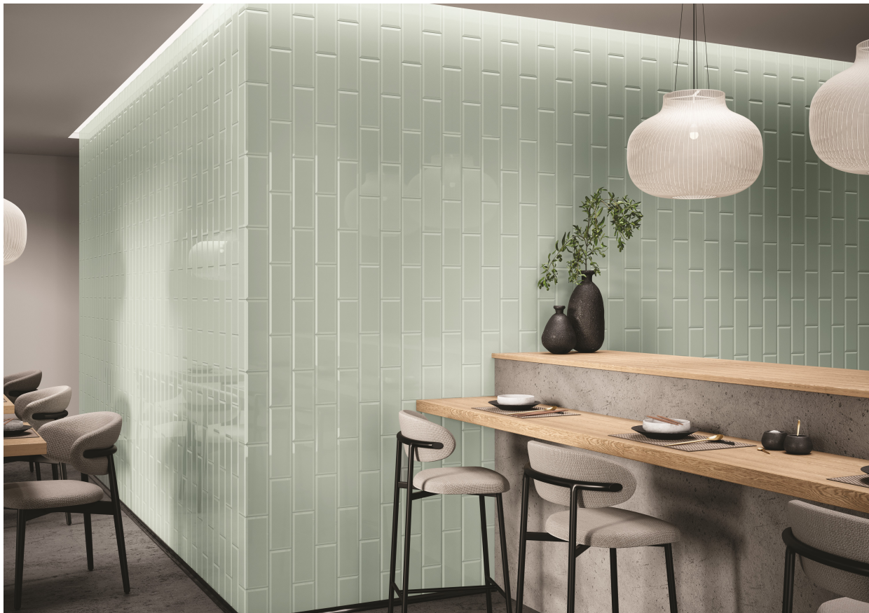
Mint 4 x 12 Gloss

This tile product is produced with a V1 variation. Differences among pieces from the same production run are minimal. Inspect the product upon delivery and for best results, blend tile from several cartons during installation.