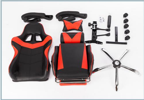
ALL INCLUDED PARTS