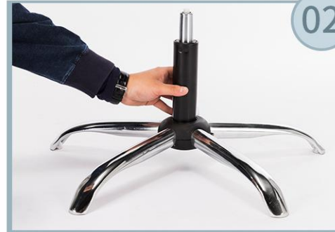
02 Install the gas lift into the base