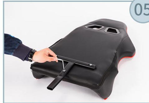
05 Install the "T" tray on the backrest