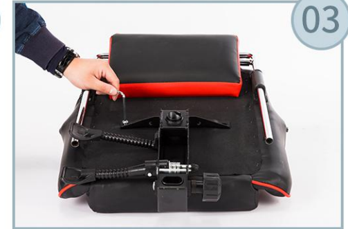
03 Install the function tray on the seat