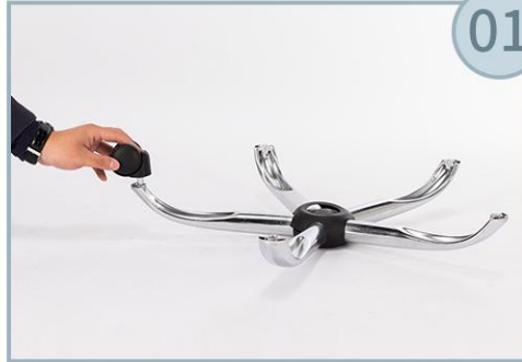
01 Plug in the wheels