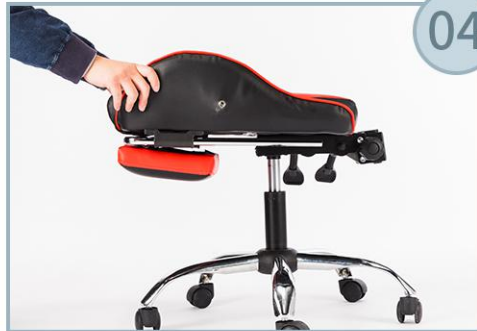
04 Align & attach the seat to the base