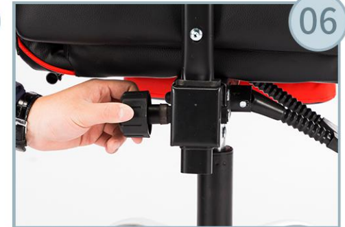
06 Insert the "T" into the function tray