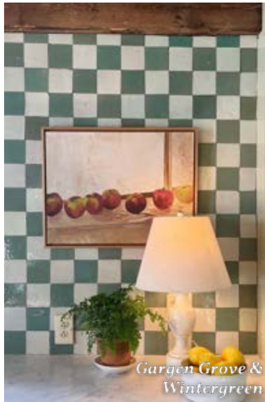
Gargen Grove & Wintergreen