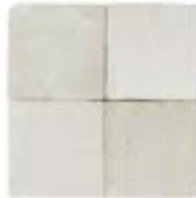
OYSTER SHELL ZL-102