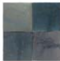
MIDNIGHT SWIM ZL-M40