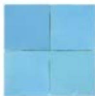
SKY BLUE ZL-401