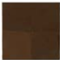
BURNT UMBER ZL-602