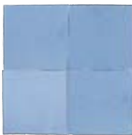
GRAPE HYACINTH ZL-409