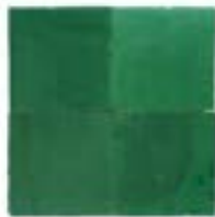
EMERALD GREEN ZL-306