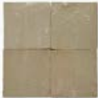
TERRE NUE GLAZE ZL-N02