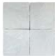
MODEST GRAY ZL-205