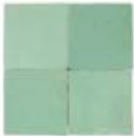
PARADISE GREEN ZL-305