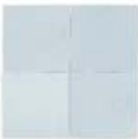
8 FROSTED SILVER ZL-405