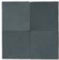
DARK CHARCOAL ZL-207