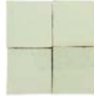
LIGHT GREEN TEA ZL-310