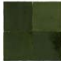
DEEP FOREST ZL-303