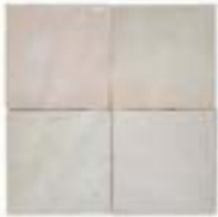
BLUSHED LINEN ZL-502