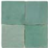
HIGH TIDE ZL-307