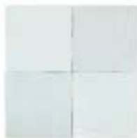
WHISPER BLUE ZL-406