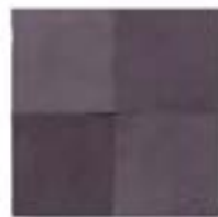
PLUM ASH ZL-510