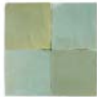
GARDEN GROVE ZL-301