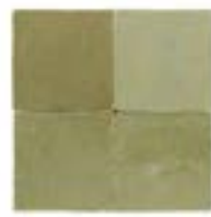
SPANISH OLIVE ZL-309