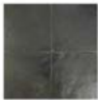
BLACK SATIN ZL-S20