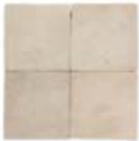
NATURAL UNGLAZED ZL-NAT