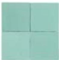
PARADISE SATIN ZL-S40