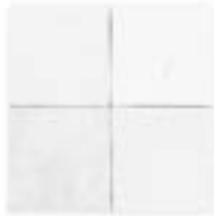
SNOW WHITE ZL-100