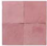
DUSTY ROSE ZL-506