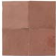
COPPER ROSE ZL-505