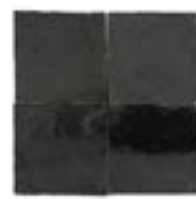
METALIC BLACK ZL-204