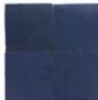
MARIANA BLUE ZL-404