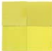
SUNNY CITRON ZL-701