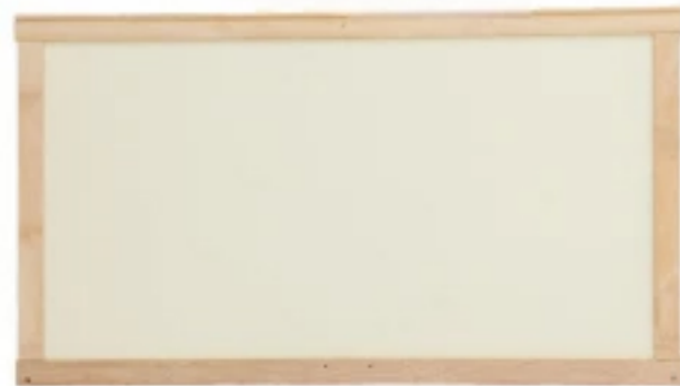
Wide laminate * 3