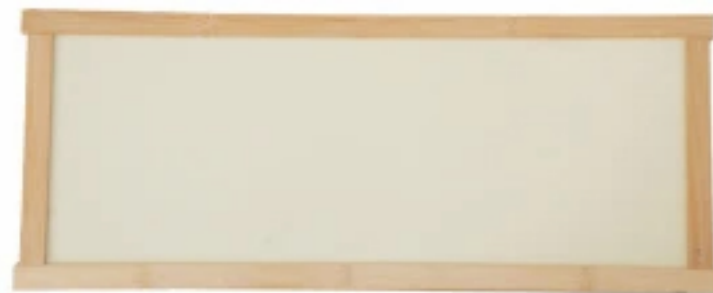
Narrow laminate * 4

When installing, pay attention to the door magnetic attraction side facing the outside