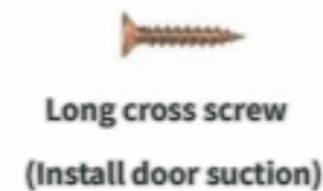
Long cross screw (Install door suction)