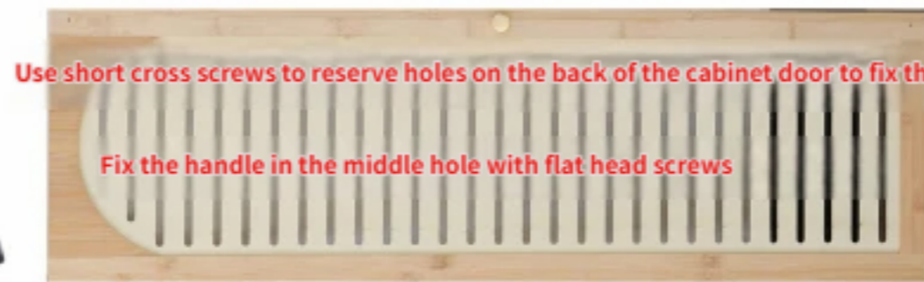
Cabinet door * 2

Card the entry shaft at the left and right ends of the drawer board