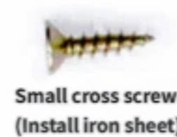
Small cross screw (Install iron sheet)