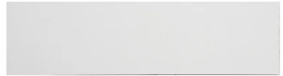
Large back plate * 2