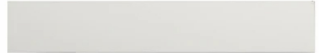
Short back plate

When installing, pay attention to the door magnetic attraction side facing the outside