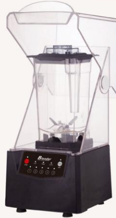
Model : GRT-LY8001