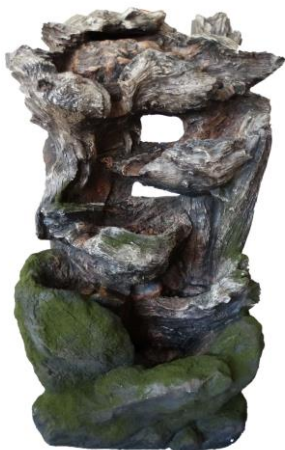
Fountain (4 LED lights pre-installed) 1x