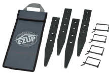
Heavy-Duty Stake Kit