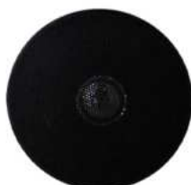
Bluetooth * :BT SPEAKER