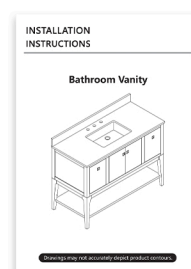
● Instruction Manual