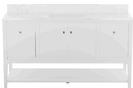
● Bathroom Vanity(With Backsplash)