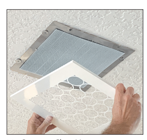
11. Snap on CleanVent.