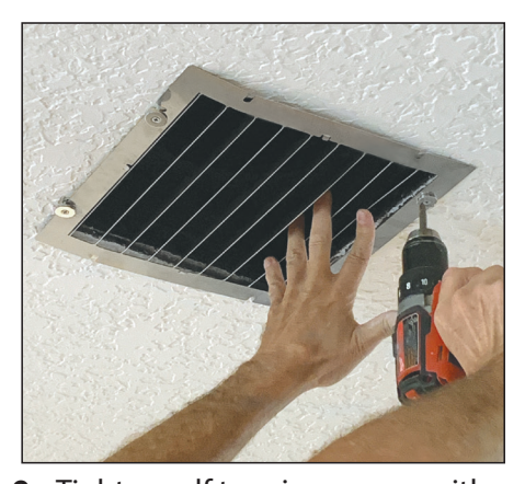
9. Tighten self tapping screws with magnets flat to the ceiling. Tighten enough to bring vent box tight to the ceiling, DO NOT over tighten and strip the screw. Position baffles as needed. They work the best as open as possible.