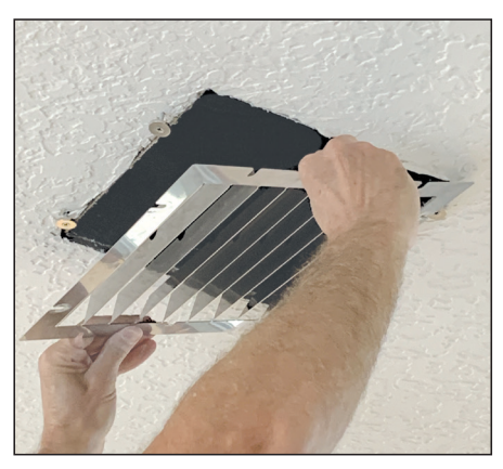
8. Install inner baffle under magnets installed.