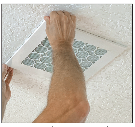
12. Position CleanVent into place.