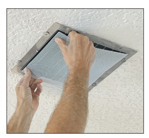
10. Place Cover Screen under tabs into position.