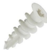
Screw in wall using phillip screwdrivers

Depending on model, mounting brackets may be either metal or plastic.