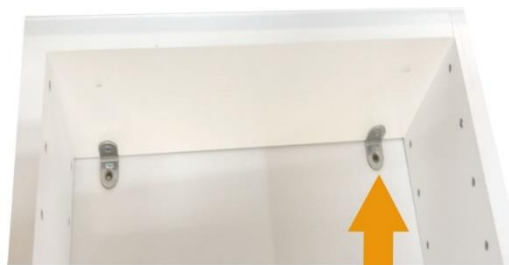
Mounting Brackets Already Installed