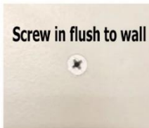
Screw in flush to wall