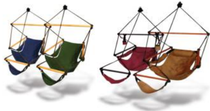
Hammaka Hammock Chair