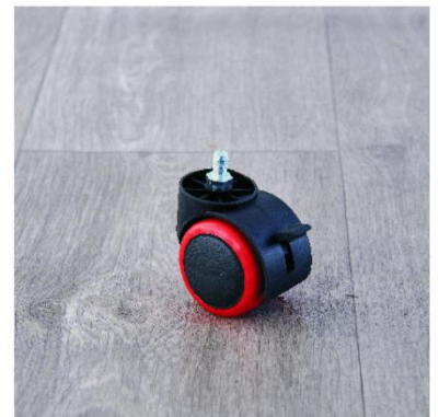
Four brake pulleys

2. Don't tighten the screws. Connect the middle two trays with screws.