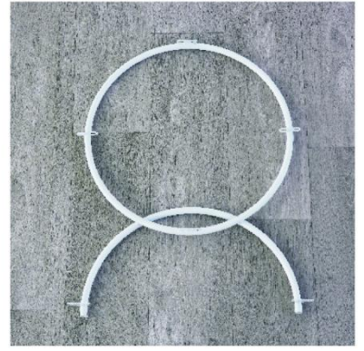
Two pieces of side bracket

1. Don't tighten the screws. Connect the middle two trays to the side bracket with screws.