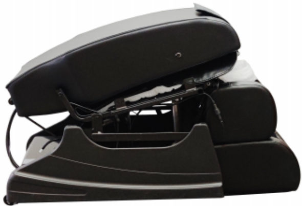
Massage chair body