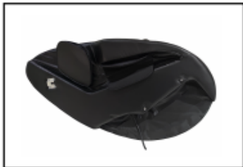
Airbag side facing up