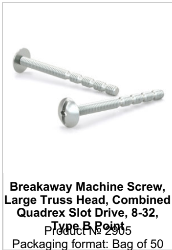
Breakaway Machine Screw, Large Truss Head, Combined Quadrex Slot Drive, 8-32, Type B Point Product № 2905 Packaging format: Bag of 50 units