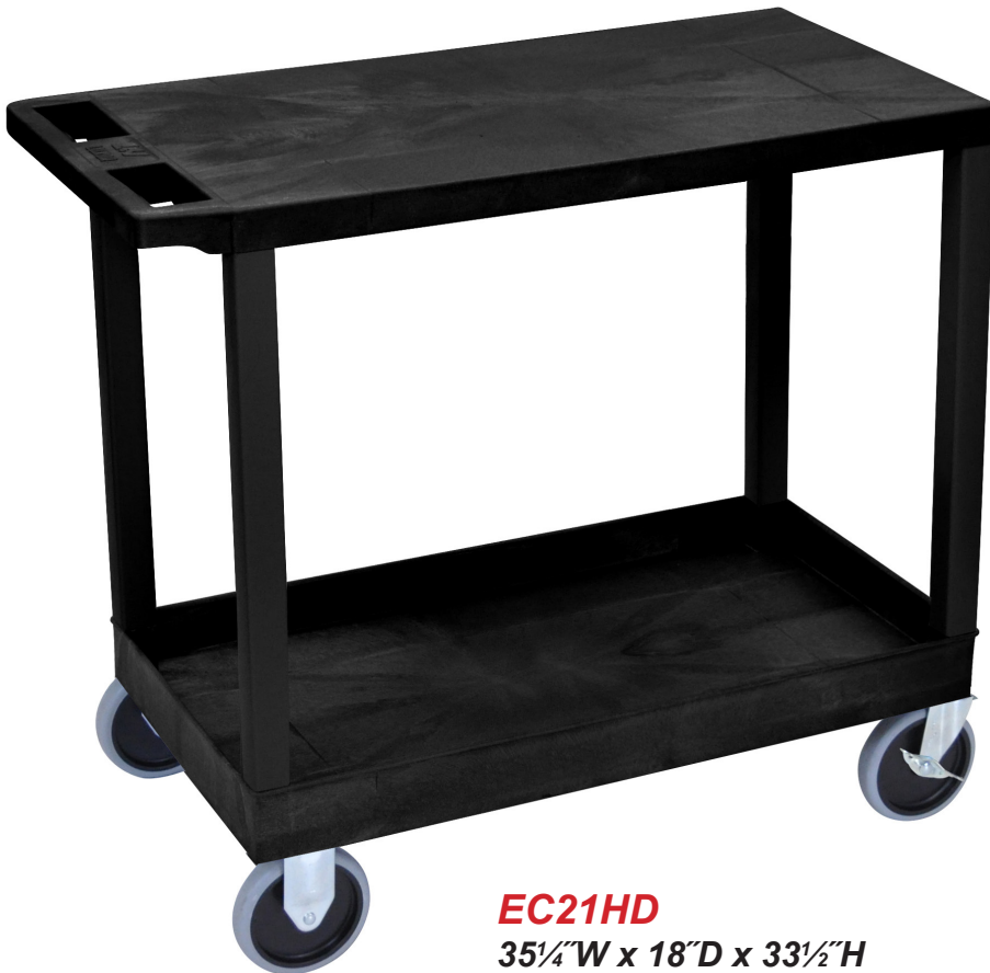
EC21HD 35¼"W x 18"D x 33½"H