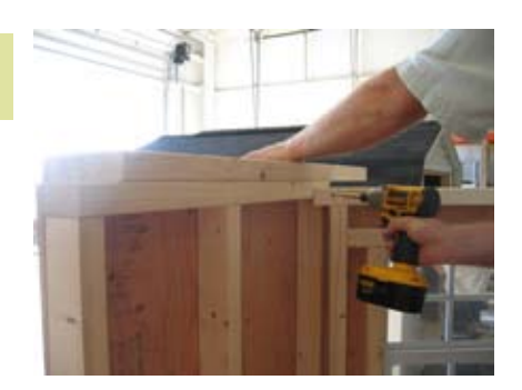
Fasten panel F.