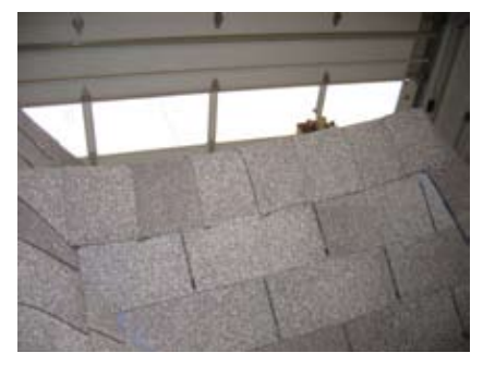
Use a leftover piece of shingle tab to cover this center.