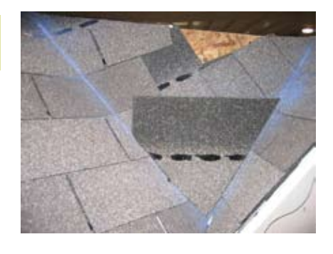
Shingles all the way sround the turret.