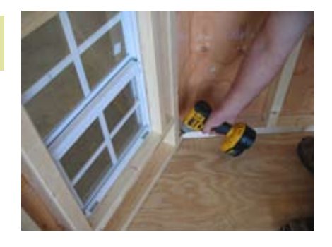
Install panel C.