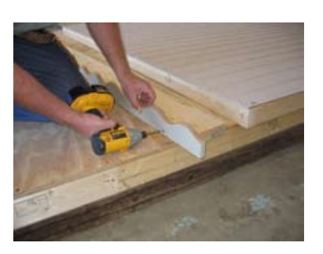
Fasten 2x6 to panel A. Note where to keep even.