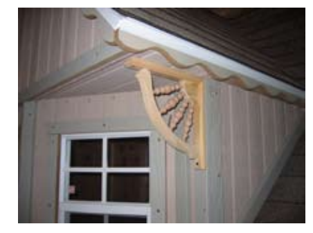
Install 2 smaller pieces on either side.