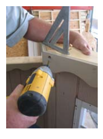
Install panel O.