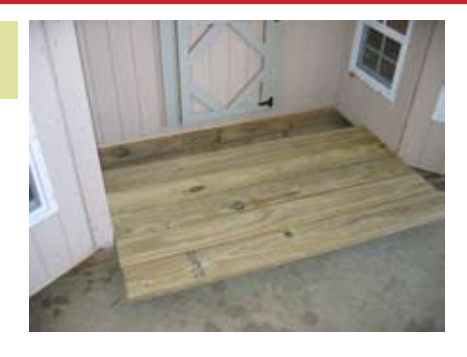
Install Panel U, the porch deck as shown.