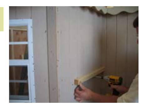
This shows the preplaced piece on which the porch roof will rest.