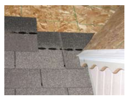
Continue with shingles.