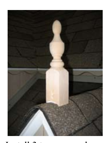
Install 3 toppers as shwon.