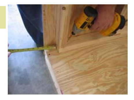
Leave 2.5" for the next wall. If this does not match, check to amke sure there are no extra gaps in the turret.