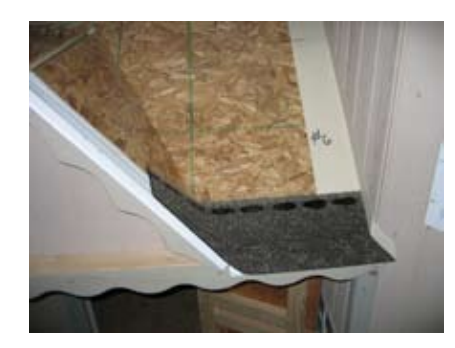
Place starter strip.