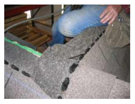
Continue installing and cutting ridge cap to fit.