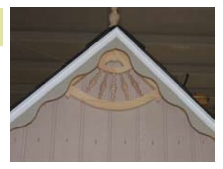
Install the large fancy trim in the gable of teh bay window side.