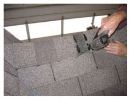
When you reach teh middle you may have to trim it a little bit to fit in.