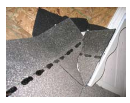
Install shingles over these. Leave small place between shingles so that water is not trapped.