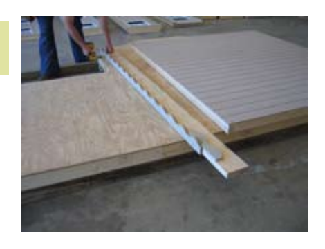
Lay panel A 2x6 with gingerbread as shown.