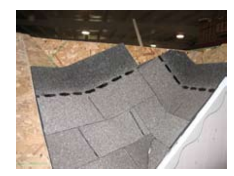
Snap a chalk line down the center of each valley. Place shingles in this area to fit.