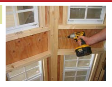
Install panel D. Make sure distance is 2.5" as shown.