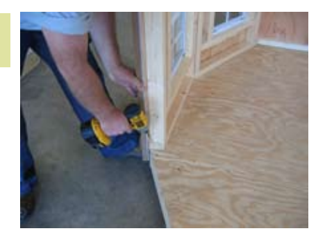
Fasten them in the center like this.