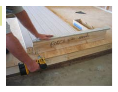
Fasten bottom of the siding to the floor. Be sure to do this all around.