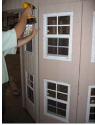
Fasten trim pieces as marked. Do this all around the building.