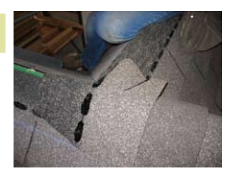
This shows another piece.