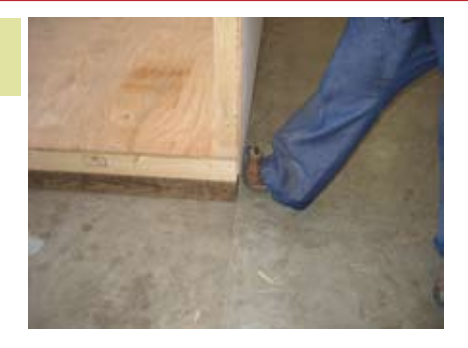
Fasten panle A.