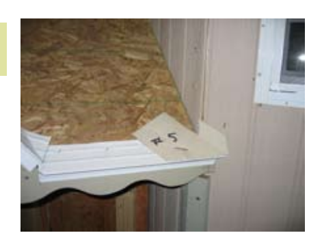
Place and fasten flashing #5 on porch roof by turret side.