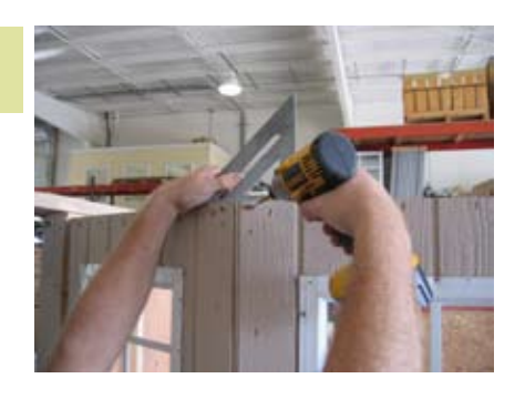
Fasten 2x6 with gingerbread to panel E.