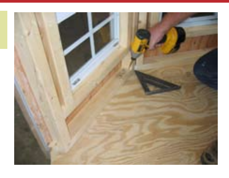
Use 2.5" screws to pull panels together.