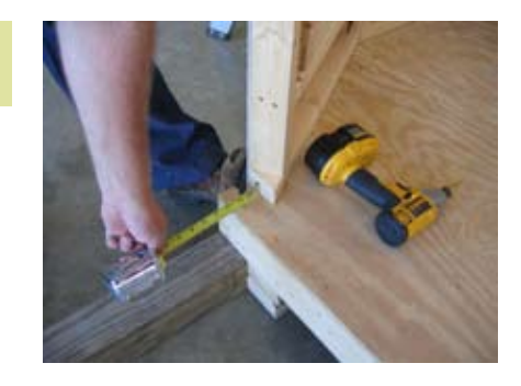
Install panel. Fasten panel D to panel E where it is marked.