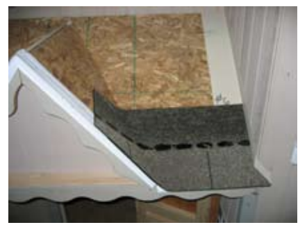
Fit shingle around teh corner.