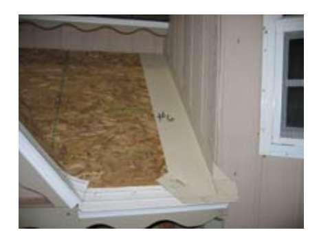
Fasten flashing #6