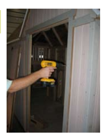
Fasten trim pieces beside adult door.