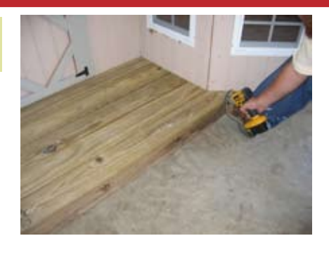
Fasten the deck as shown.