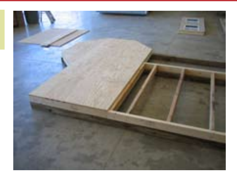
Add the turret sections of the floor to the rest of the floor and 4x4's.