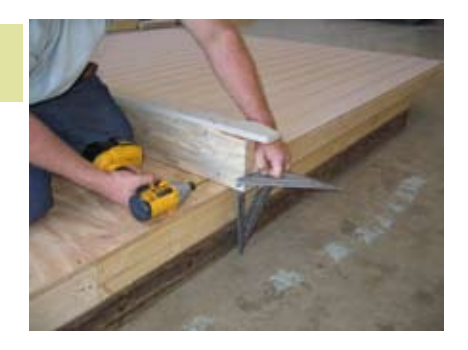
Set up panel A. Be sure to keep the bottom of the siding pushed in.