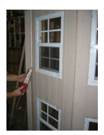
Caulk the gaps in the bay window and turret sides.