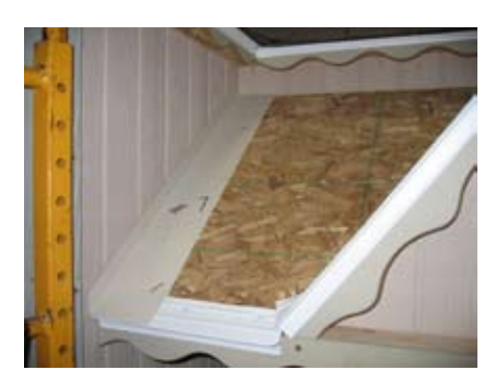
Fasten flashing #7