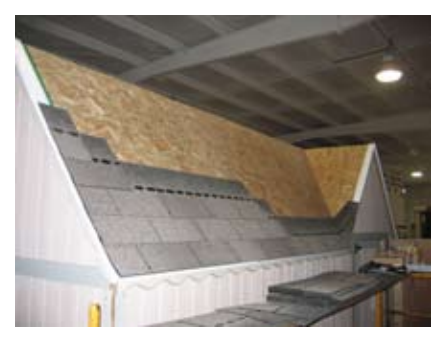
Install shingles on back turret side.