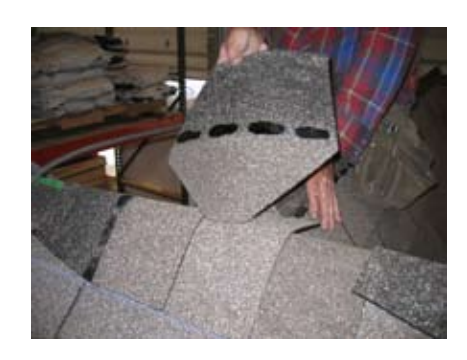
Cut a piece like this to go out to the other ridge line.