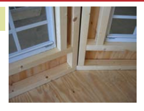
Fasten tops and bottoms as shown. This will make it sturdy.