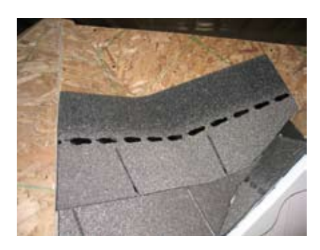
Continue installing shingles from either side.