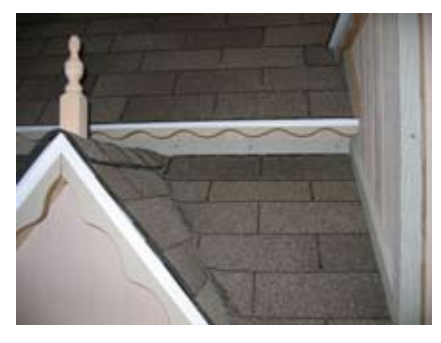
fasten teh trim on the back and sides of teh porch dormer.

Install trim on the backside of teh turret, Also note the small trim piece that is covering teh flashing by the shingles. (you had to remove it to install the flashing).