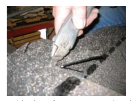
Cut shingle to fit over. Note using the hook knife.