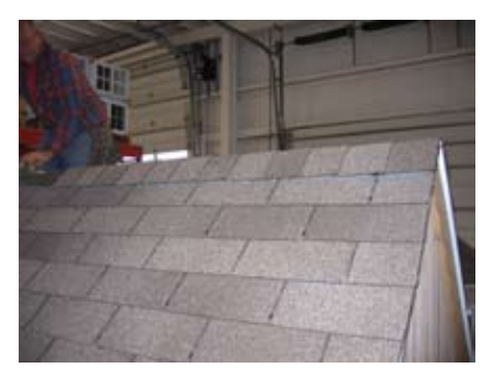
Run shingles up the small side over teh valley. Then chalk the center and cut long side shingles to match.