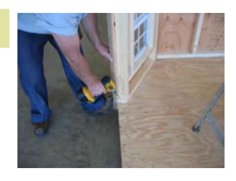
Align top edge to mark and fasten.