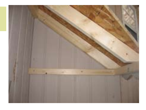
This shows how the porch roof fits on top.