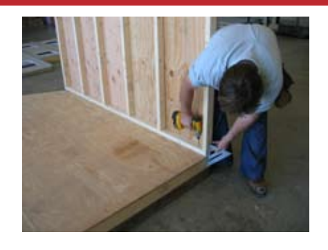
Install panle B as shown. Fasten in the front then the back.