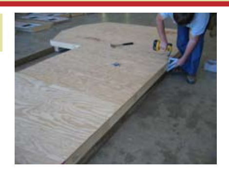
Make sure it is even on the ends before fastening. Then add plywood to the center after fastening turret section.