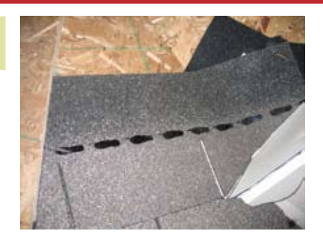
Continue fastening shingles.