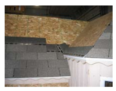
Continue on both bay window and turret side.