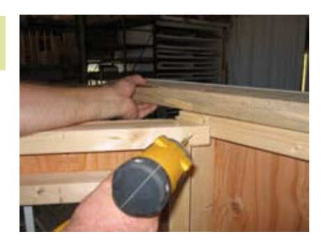
Note how the bottoms fit together.