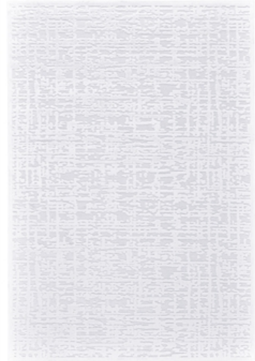
WHITE / WHITE