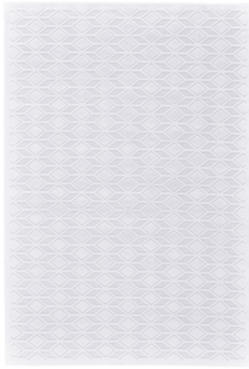
WHITE / WHITE