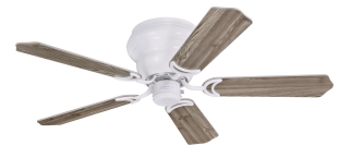
Reversible White Washed Pine Finish Blades