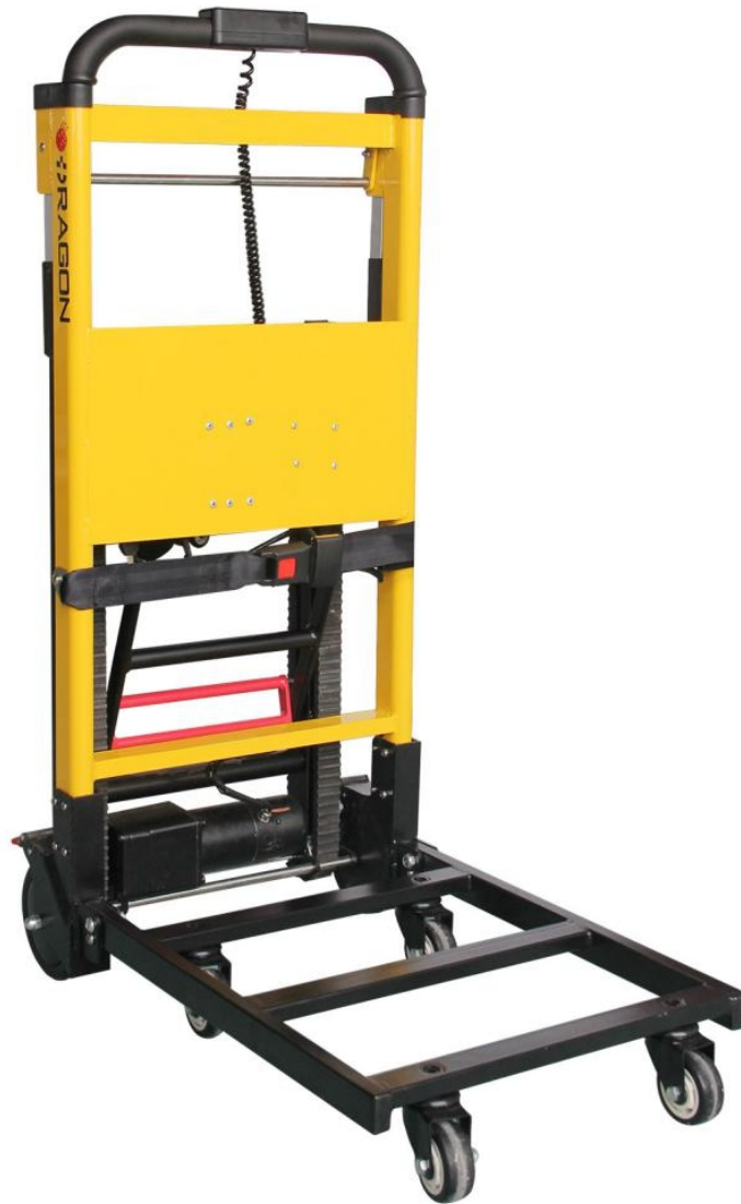
Stair Climbing Hand Truck