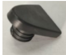
2 Front Footpads