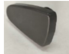
2 Rear Footpads