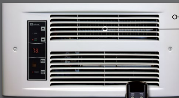
(Shown in White Dove)