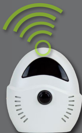
EC02S Temperature Sensor