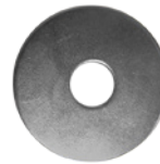
(20) 1/4" washers