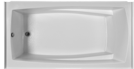
Shown with Whirlpool Package

All airbaths include a pre-leveled foam base.