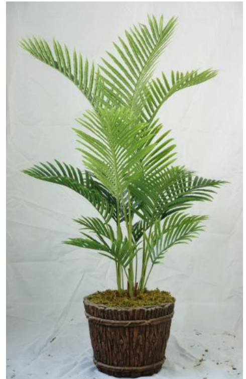
Finished Palm Plant