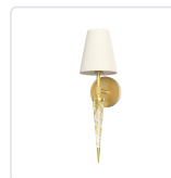
WV351101VBFG Gold Flake/Vintage Brass