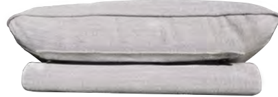
TOP OF CHAIR

Back support cushion can be removed in order to wash the fabric cover. In order to remove the cushion, unzip the two zippers and pull cushion from velcro bottom.