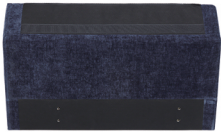
1 PC Right Armrest