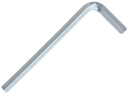
1 PCS Wrench