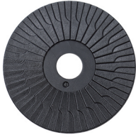
4 PCS Gasket