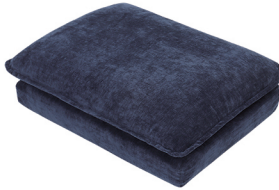
1 PC Seat Cushion