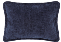
1 PC Pillow