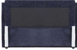
1 PC Backrest