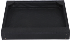
1 PC Seat Frame