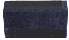
1 PC Left Armrest