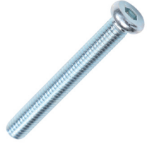
12 PCS Screws M8X60mm