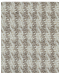
CP01 - TAUPE