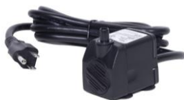
Fountain Pump 1x