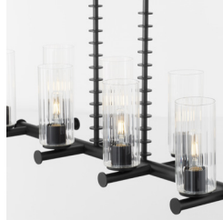
ADDITIONAL DETAILS: Rectangle Hinge Chain