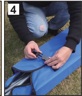
Buckle up the canopy.