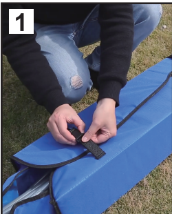
Unbuckle the canopy.