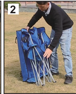
Fold the chair.