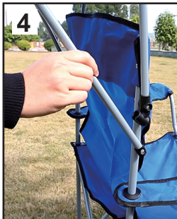
Adjust and fasten the canopy.