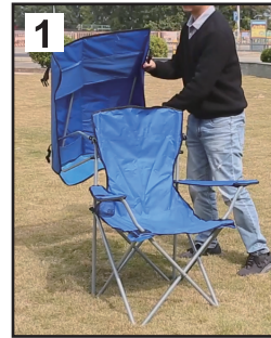
Fold down the canopy.