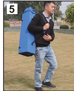
Carry the chair where your journey takes you.