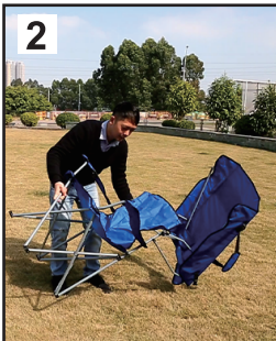
Unfold the chair.