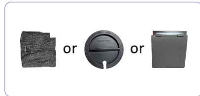
02 Fountain Back Panel