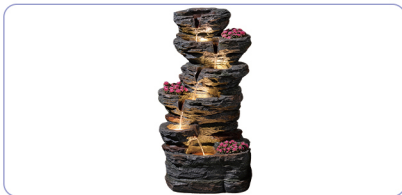
01 Water Fountain