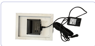
03 Solar Water Pump