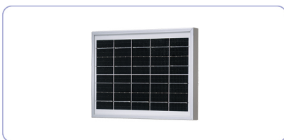
07 Solar Panel

*The water pump and transformer are housed in the same small box.