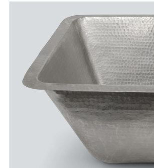
Bar & Prep Sinks