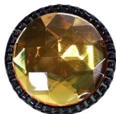
Jewel Nut x1