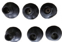
Mute foot plug x6