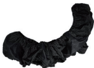
2.Protective case x1