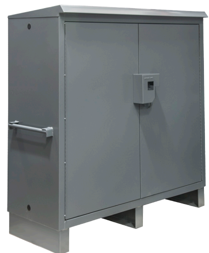
Job Site Cabinets