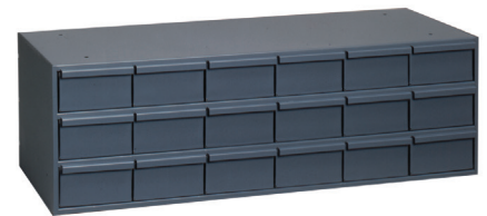
Small Parts Drawer Cabinets