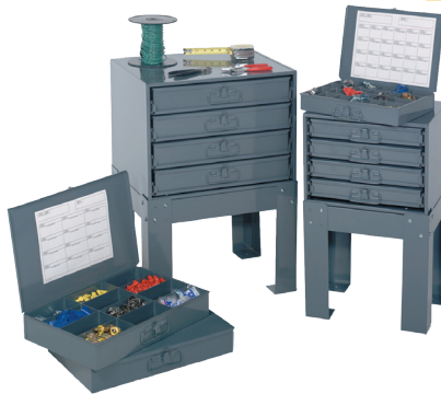
Fastener Drawer and Racks