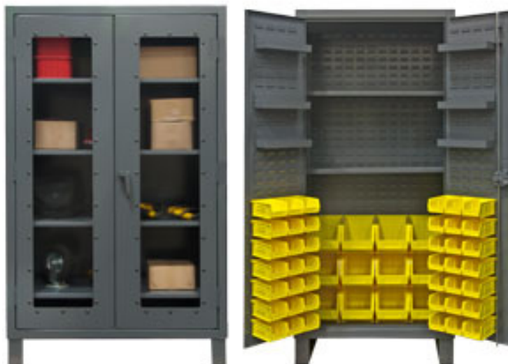
Extra Heavy Duty 12 Gauge Cabinets