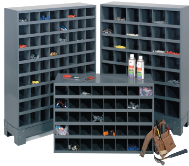
Nut & Bolt Bins