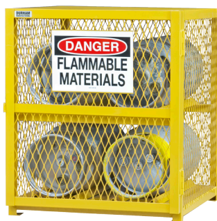
Safety Storage Products