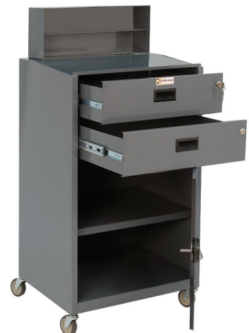
Mobile Shop Desks