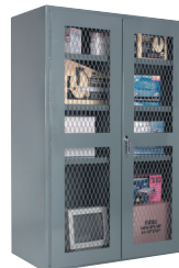
Heavy Duty Clearview Storage Cabinets