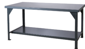
Heavy Duty Workbenches