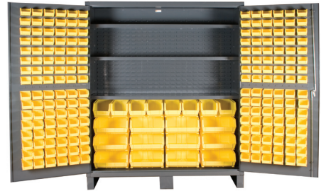
Heavy Duty Bin Cabinets