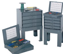
Scoop Compartment Boxes and Racks