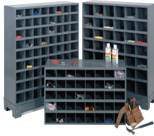
All Welded Parts Bins