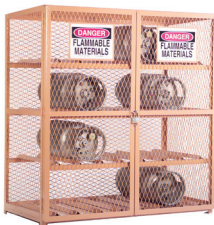
Safety Storage Products